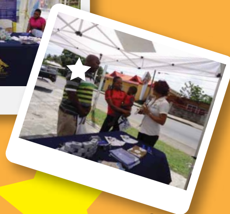
Canaan Community Outreach