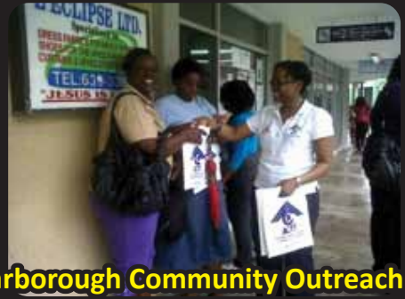
Scarborough Community Outreach

Over the last three months, ACTT's staff in Tobago, located at the Tobago Technology Centre, Milford Road Canaan, embarked on a community outreach initiative which was designed to increase awareness about its services. Since the launch of its Tobago Student Caravan on June 1, 2012, the ACTT team has visited Roxborough, Canaan, Buccoo and most recently Scarborough and interacted with over 600 visitors to these displays. In the near future, ACTT will visit other communities including Les Coteaux, Whim and Lambeau as well as collaborate with the Tobago House of Assembly's Financial Assistance Unit to provide students seeking scholarships, with the relevant information to apply for ACTT's Statement on Recognition.